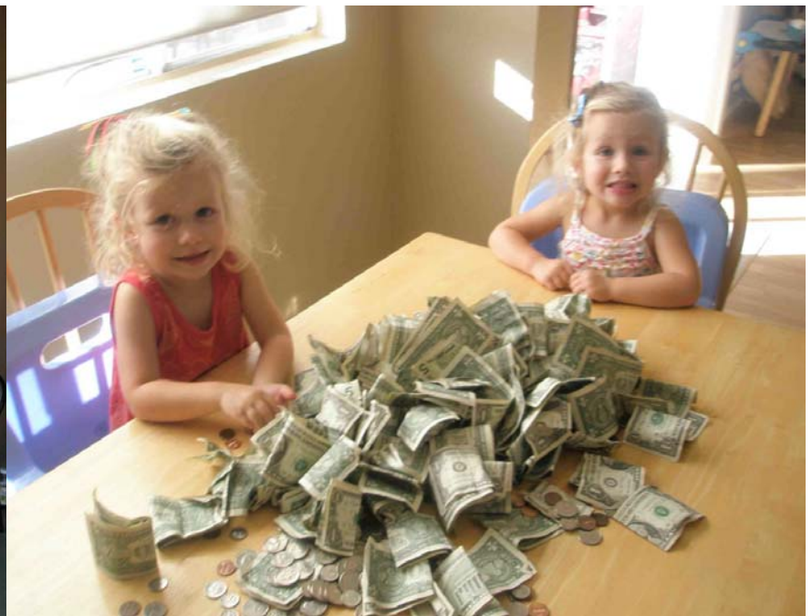
All the cash was accounted for!