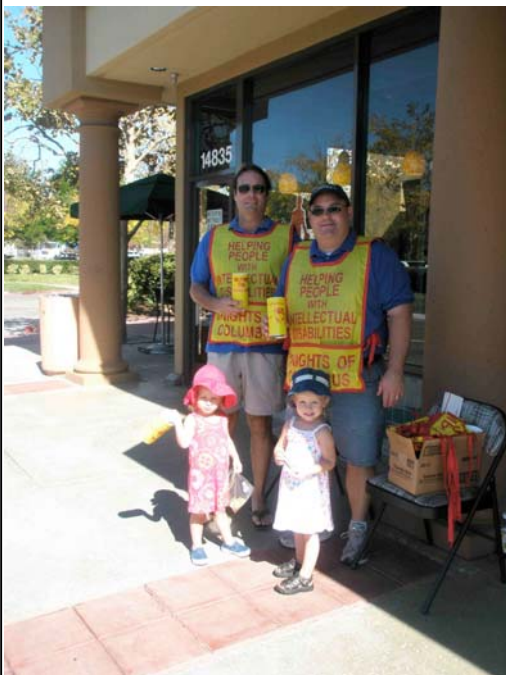
Out in Full Force!